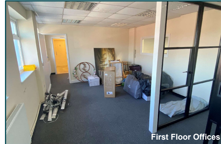
First Floor Offices