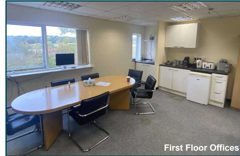
First Floor Offices