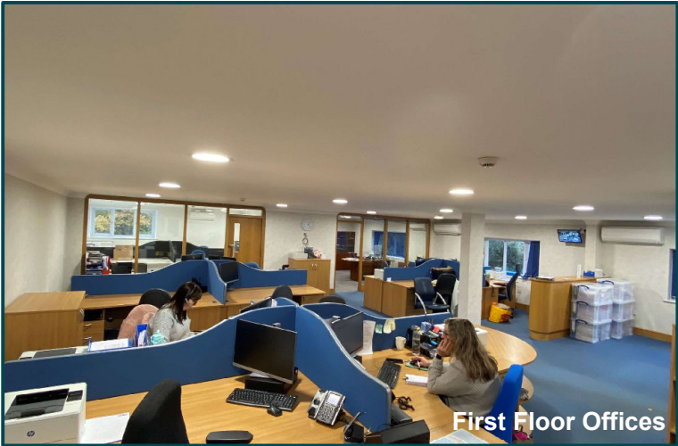
First Floor Offices