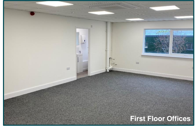
First Floor Offices