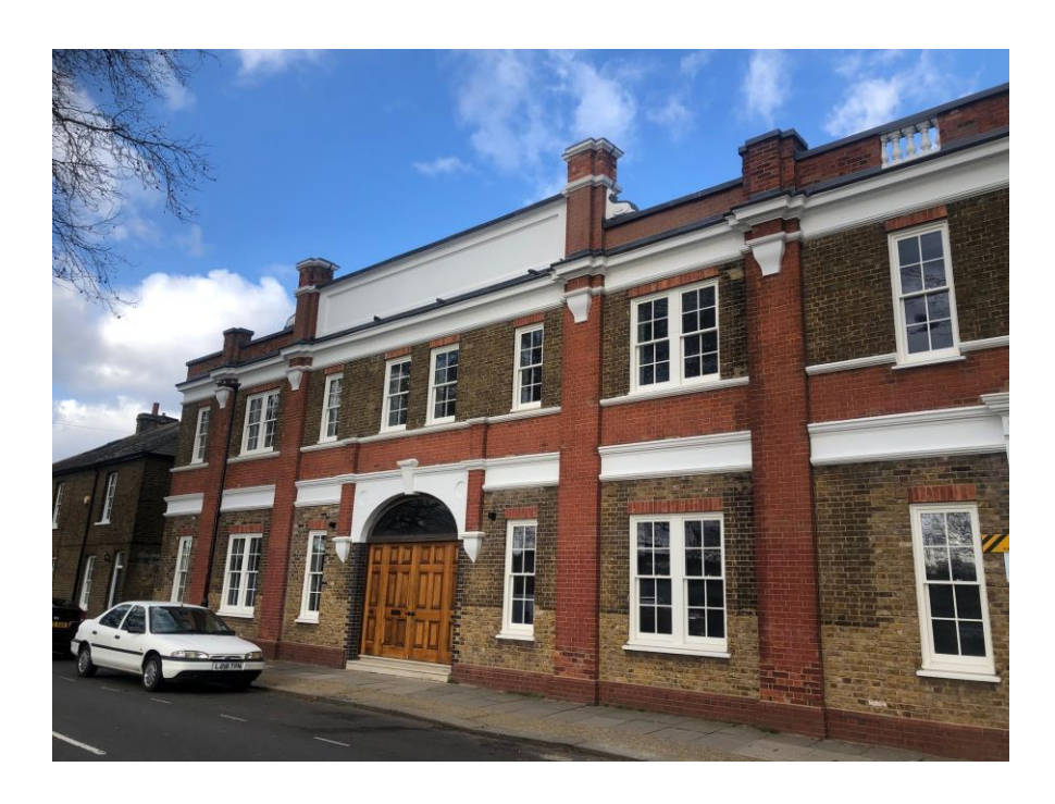
Self-Contained office building To Let